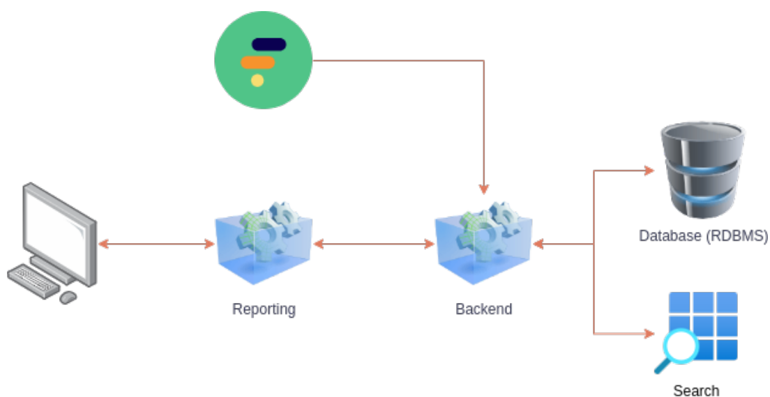
Figure 1.1. Analytics components

The following figure illustrates the overall Formcentric Analytics system and offers an initial introduction to the architecture.